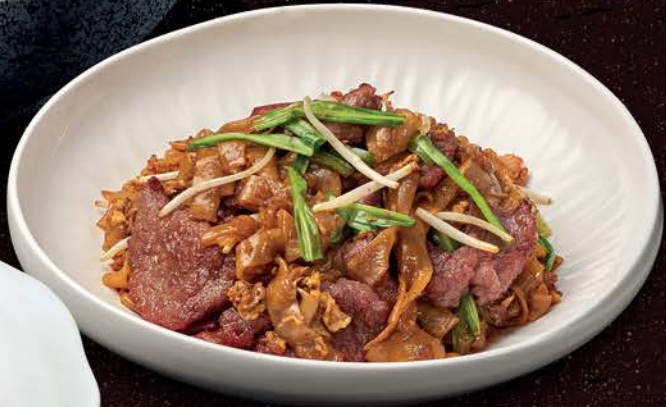
青龙菜干炒牛河粉 Wok-fried Beef Hor Fun with Dragon Vegetable