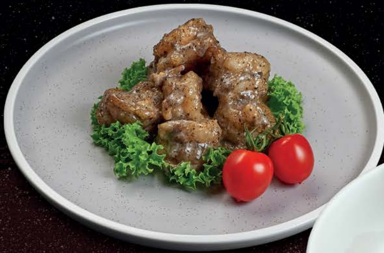
黑松露胡椒脆虾球 Crisp-fried Prawn with Black Pepper-Truffle Cream