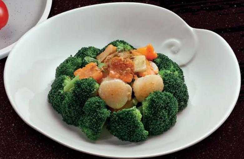
蒜香带子炒西兰花 Stir-fried Fresh Scallop with Broccoli and Golden Mushroom