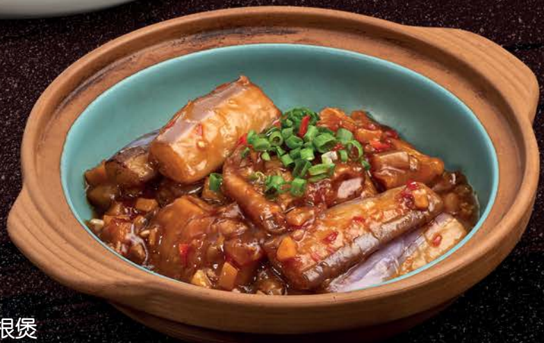
鱼香筋子豆根煲 Braised Eggplant with Fresh Gluten Puff and Salted Fish in Sichuan Style