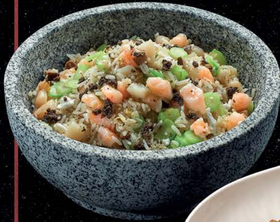
黑松露海鲜粒炒饭 Fried Rice with Diced Seafood and Black Truffle