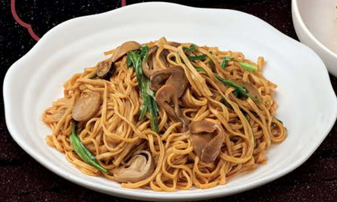
干烧伊面 Stewed Ee-fu Noodles with Mushroom