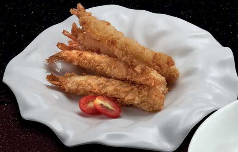
黑松露胡椒天妇罗虾 Crisp-fried Tempura Shrimp with Black Pepper Truffle Cream