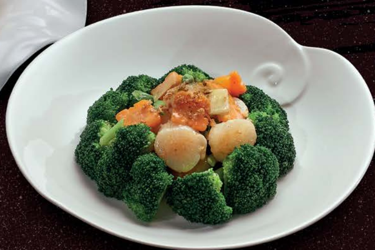
蒜香带子炒西兰花 Stir-fried Fresh Scallop with Broccoli and Golden Mushroom